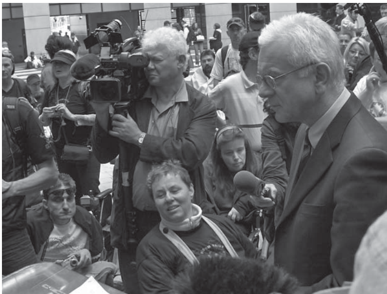
A meeting with the President of the European Parliament during the Strasbourg Freedom Drive