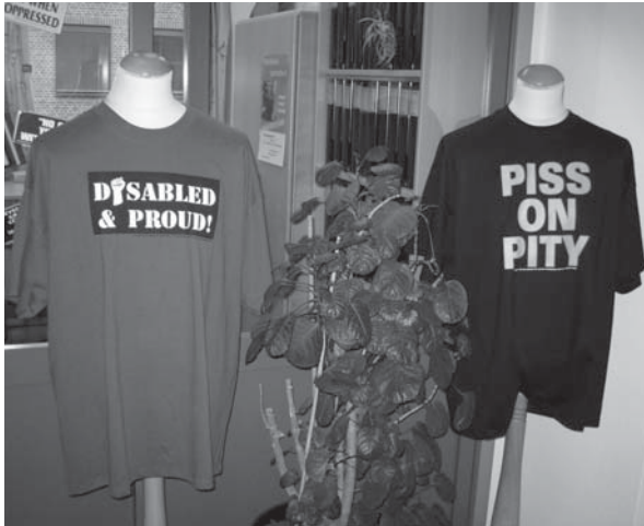
T-shirts produced by ULOBA, Norway