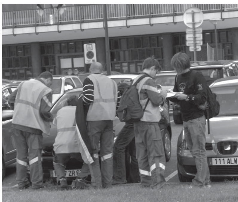
A participant in the Strasbourg Freedom Drive collects signatures on a petition during the march