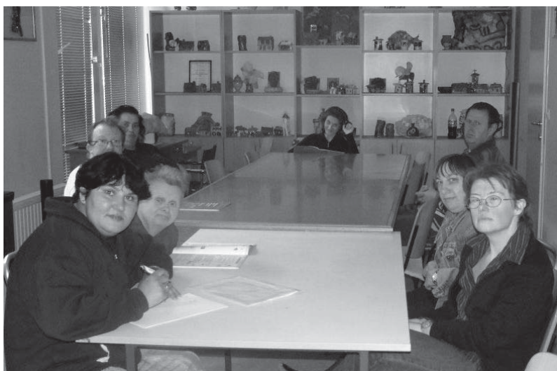
A meeting of self-advocates from the Association for Self-Advocacy in Croatia