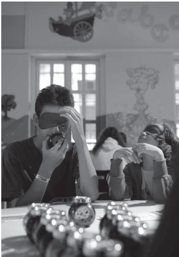
Games in the Ability Park, Hungary (see case study in Annex 3)

It is likely that any advocacy work you do will seek to raise awareness about the rights of people with disabilities and the human rights violations that they suffer on a daily basis. However, another important area of advocacy will be to challenge stereotypes and negative images of people with disabilities. An example of an awareness raising activity is a publicity campaign with images of disabled people living and working in the community (using leaflets, posters and promotional videos). Some groups also organise benefit concerts, award ceremonies, exhibitions and other cultural events that are open to the public, thereby bringing the issues to the attention of a wider audience than more specialised events. Awareness raising events can also be used as fundraising opportunities. (See examples at the end of this chapter and in Annex 3.)