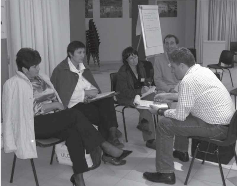
Discussing advocacy strategies at the ECCL workshop on 11 September 2008 in Drammen, Norway

The manual is currently available in an English easy-to-read version. In the future we hope that it will be translated into other languages. Please check ECCL's website for updates.