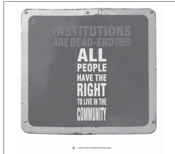
Poster produced by the Association for Promoting Inclusion, Croatia