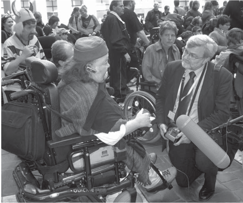
A Board member of the European Network on Independent Living gives interviews in the lobby of the European Parliament during the Strasbourg Freedom Drive